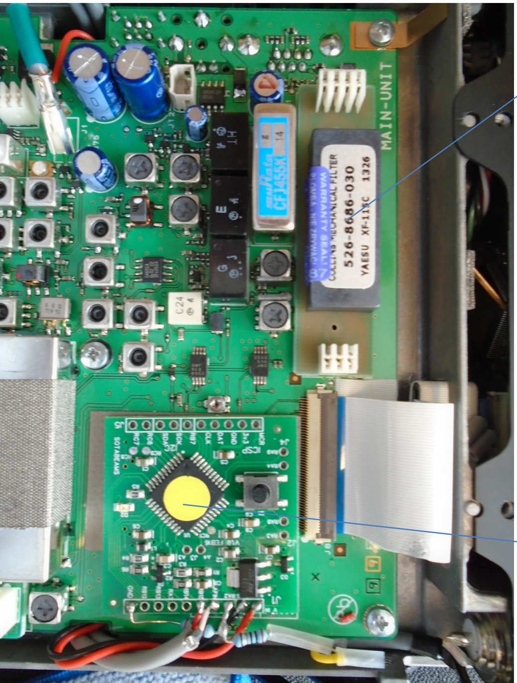
Yaesu FT-817ND: P.C.B. Top View with added filters

Sotabeams Laserbeam-817 500Hz C.W. and S.S.B. Filter