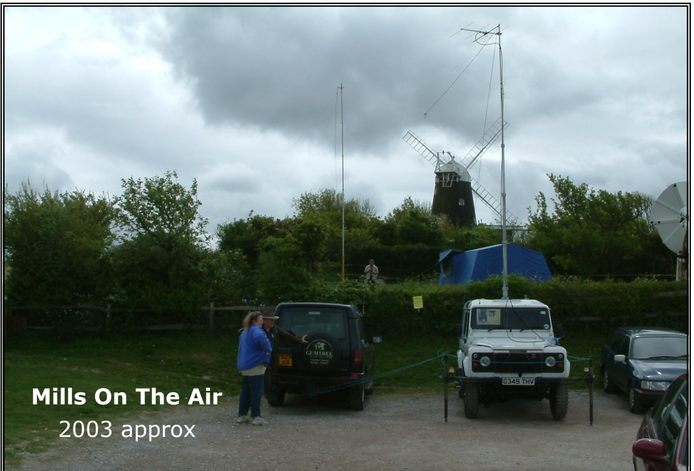
Mills On The Air 2003 approx