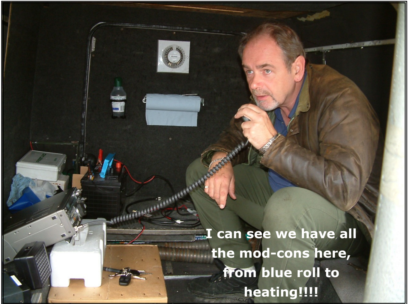
I can see we have all the mod-cons here, from blue roll to heating!!!!