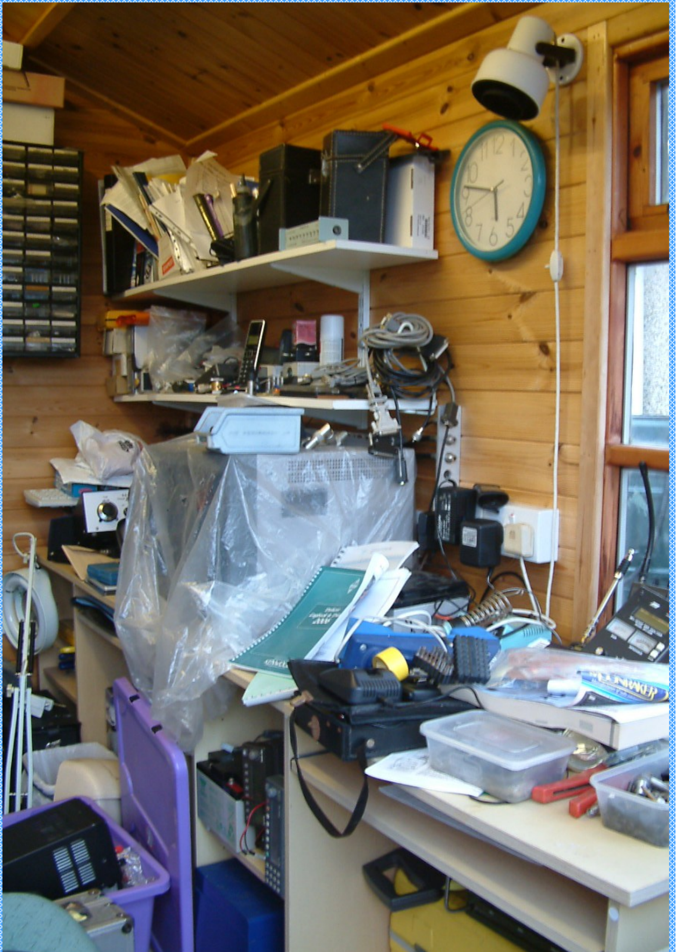
Members Shack Number 2 (more over page)