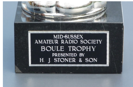
Boule Trophy Base