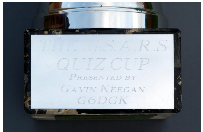
THE MSARS Quiz Cup Base