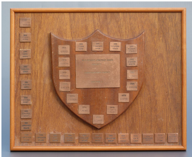
Construction Section 2