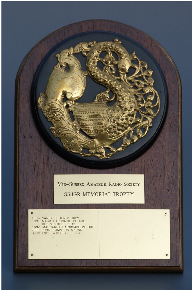
G3JGR Memorial Trophy